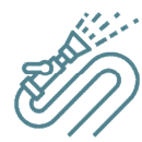
RUNNING THE HOSE

For more information on what to do after plumbing changes inside or outside the home, go to: bit.ly/391ycD0 .