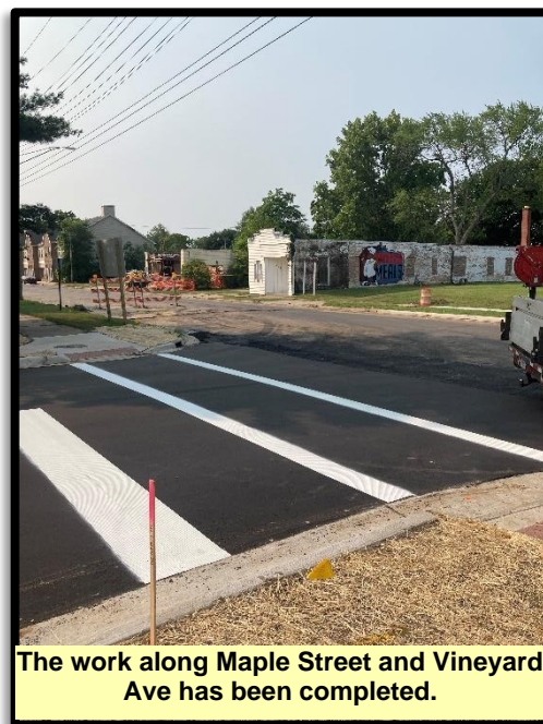
The work along Maple Street and Vineyard Ave has been completed.

Northern Construction Services continued on the Maple Street and Vineyard Ave project. The contractor worked to cleanup the site this week. Most contract items have been completed at this time. A walkthrough is being schedule for the project. After a walkthrough, a punch-list will be created and provided to the contractor. Once the contractor has completed the items on the punch-list, the project will be fully complete. The project is expected to be completed soon.