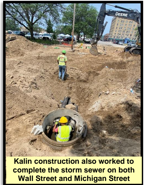
Kalin construction also worked to complete the storm sewer on both Wall Street and Michigan Street

Construction on the Pipestone Corridor Project Phase 3 continued these past few weeks. Kalin has continued work along Michigan Street and Wall Street. Along Wall Street, Kalin Construction worked with their subcontractor to complete the full water main tie-in to the existing mains at the limits for the project as well as complete the remaining storm sewer work. After completing the work, the trench was backfilled and compacted. On Michigan Street, Kalin Construction worked to complete the storm sewer by finalizing tie-ins to existing sewer. The removal of sidewalk along Wall Street was also able to begin.