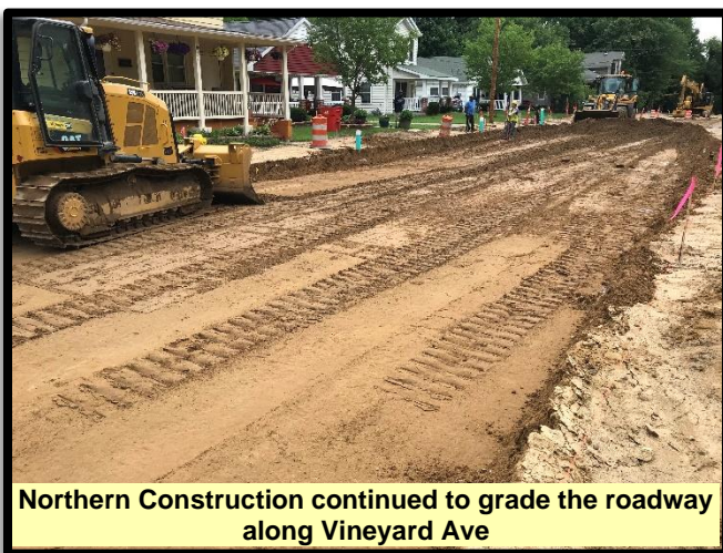
Northern Construction continued to grade the roadway along Vineyard Ave

Northern Construction Services continued work on Vineyard Ave. The contractor worked to grade the roadway and adjacent area in preparation for the placement of concrete curb and gutter on Vineyard Ave. Once areas of curb and gutter were completed, Northern Construction shifted to have the sidewalk and driveways placed. They also worked on Maple Street to restore the areas outside of the pavement. They first graded the subgrade of these areas. They then moved to placing topsoil in these areas. Once the topsoil was placed, they seeded and placed mulch blanket over these areas.