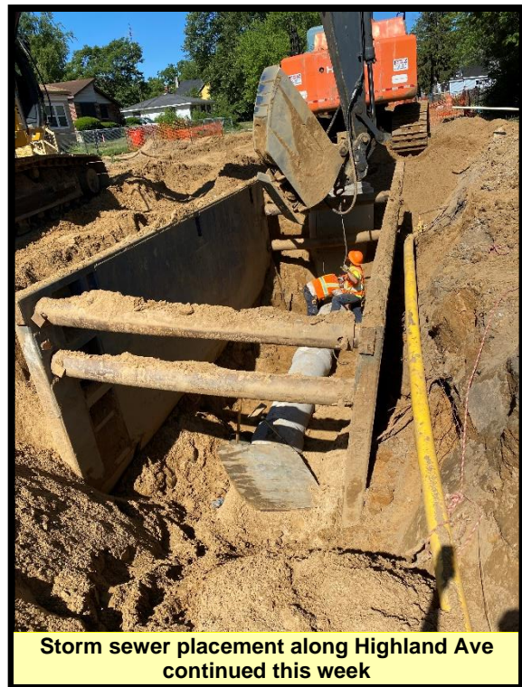
Storm sewer placement along Highland Ave continued this week

Next week, the contractor will continue to work on the storm sewer along Highland Ave, near Fair Ave. They will continue to complete all water service work needed. The contractor will also be placing concrete curb and gutter along Highland Ave and grading the roadway. The project is scheduled to be completed in July.