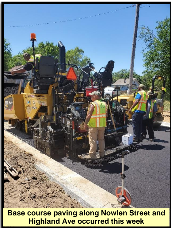
Base course paving along Nowlen Street and Highland Ave occurred this week

Selge Construction continued on Phase 2 of the Northeast Section project this week. The installation of new water services continued during the past week as well as the storm sewer installation. Selge worked on placing the storm sewer, working east along Highland Ave toward Fair Ave. Selge Construction worked on grading the roadway and placing curb and gutter this week. The contractor was also able to pave the base course on Highland Ave from Hull Ave to Benton Street and Nowlen Street from Highland Ave to Cass Street. Selge Construction also work on grading and compacting the roadway of Highland Ave from Benton Street toward Fair Ave.