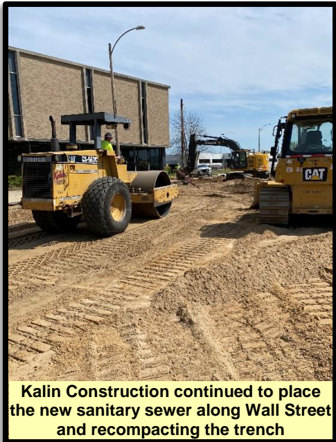
Kalin Construction continued to place the new sanitary sewer along Wall Street and recompacting the trench

Construction on the Pipestone Corridor Project Phase 2 and 3 continued this week. Kalin worked on the placement of the sanitary sewer along Wall Street between Pipestone Street and 4 th Street and was able to get all of the sewer completed. While placing the sanitary sewer main, the contractor also worked on placing new sanitary service laterals to each property. After they completed the sanitary sewer, Kalin shifted their operation to place the new water main along Wall Street. Kalin also worked this week to continue the restoration of the disturbed areas in the Phase 1 and 2 limits along Pipestone Street.