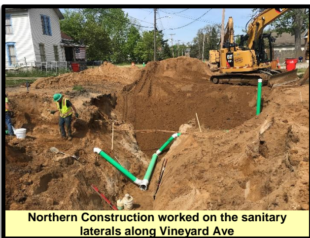
Northern Construction worked on the sanitary laterals along Vineyard Ave

Northern Construction Services continued the sanitary sewer installation along Vineyard Ave. While installing the sewer main, the contractor also worked to place sanitary sewer laterals to all the property that they cross. As the Contractor completes installing the new sanitary sewer, the trench is backfilled and compacted. Northern Construction has worked on completing water services to all the properties. All properties have been connected to the new water main.