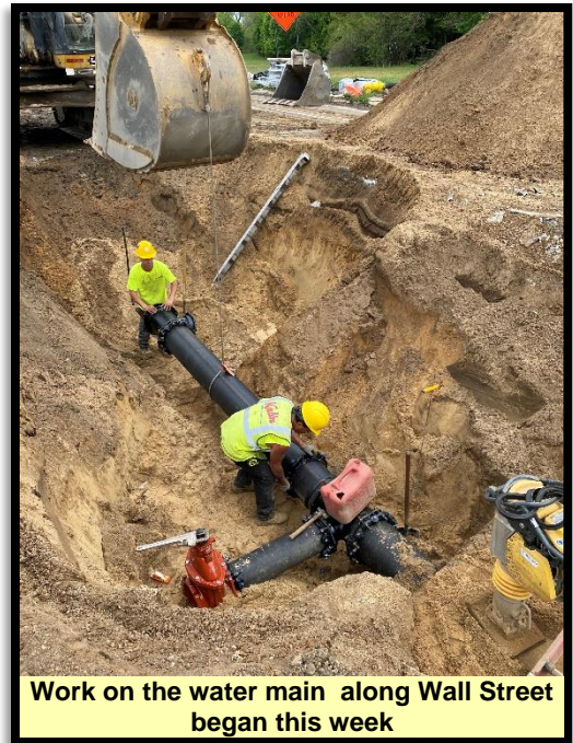
Work on the water main along Wall Street began this week

Construction on the Pipestone Corridor Project Phase 2 and 3 continued this week. Kalin worked on the placement of the sanitary sewer along Wall Street between Pipestone Street and 4 th Street and was able to get all of the sewer completed. While placing the sanitary sewer main, the contractor also worked on placing new sanitary service laterals to each property. After they completed the sanitary sewer, Kalin shifted their operation to place the new water main along Wall Street. Kalin also worked this week to continue the restoration of the disturbed areas in the Phase 1 and 2 limits along Pipestone Street.