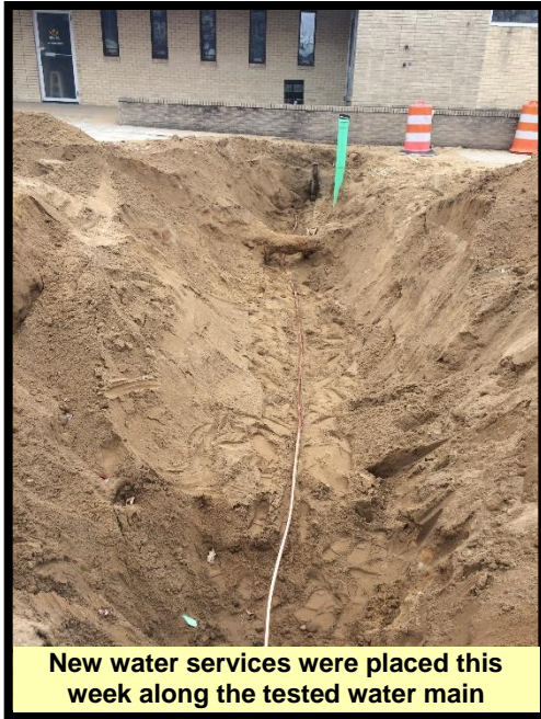
New water services were placed this week along the tested water main