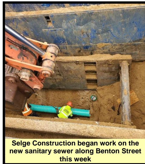
Selge Construction began work on the new sanitary sewer along Benton Street this week

along Highland Ave. As they complete sections of the new water main, the sections of main will be tested and chlorinated. Once the water main work is completed, new water services will be placed and the sanitary sewer work will begin. Storm sewer will follow the completion of the sanitary sewer. The project is progressing efficiently.