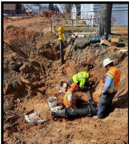
Selge Construction continued to work on the installation of the new water main along Highland Ave

Selge Construction continued construction on the Northeast Section Reconstruction project, Phase 2, this week. The contractor continued placing water main along Highland Ave. They completed the new water main testing along Benton Street and began to prepare for new water services. The contractor also started to work on the new sanitary sewer along Benton Street. They are working from Main Street south toward Highland Ave. As they are completing the installation of the new sewer, they are backfilling and compacting the trench.