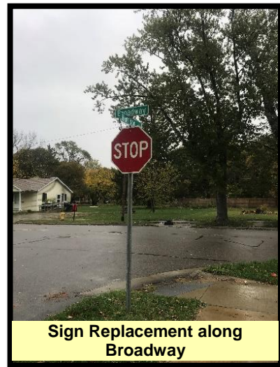
Sign Replacement along Broadway

Rathco Safety Supply has been able to complete all of the 164 intersections. During some of the high winds over the past few weeks, a number of new street name signs have become dislodged. Abonmarche and Rathco are working together to compile a list and have the signs replaced. Abonmarche and Rathco Safety Supply will be working together in the upcoming week to prepare final documents and closeout the project. The current schedule to prepare the final documents and closeout the project shortly thereafter.