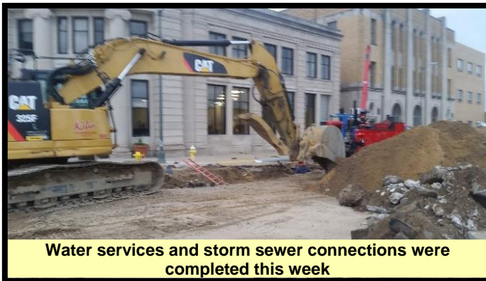
Water services and storm sewer connections were completed this week