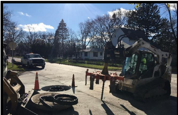
Kalin Construction has been adjusting manhole structure covers on resurfaced streets

Work on the 2020 Local Streets and Alleys project has continued this week. The contractor, Kalin Construction, performed adjustments to existing structure covers in the pavement to ensure a smooth transition to the adjacent asphalt pavement. To do this, the contractor cored a circle around each structure cover, adjusted the cover to the pavement elevation, and placed concrete pavement around the cover. All structure cover adjustments have been completed at this time. Upcoming alley work is expected to continue until project completion and will include the fine grading and debris/excess material cleanup. The project will be moving toward the closeout over the next few weeks.