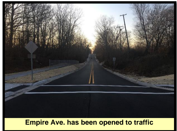
Empire Ave. has been opened to traffic

The work along Empire Ave. has all been completed and the roadway is open to traffic. A walkthrough was held on site to note any issues with the completed work and created a punchlist of items for the contractor to address. This week, Northern Construction and Abonmarche has been working together to get all the final documents together and close out the project. This work will continue for the next few week until the project can be closed out.