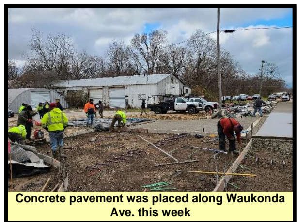
Concrete pavement was placed along Waukonda Ave. this week

Next week the contractor will work on grading Stevens Street. Concrete work along Waukonda Ave. is expected continue next week as the weather allows for the placement of sidewalk ramps. The project is scheduled to be completed by June, 2021. A detour route on Waukonda Ave. is currently in place.